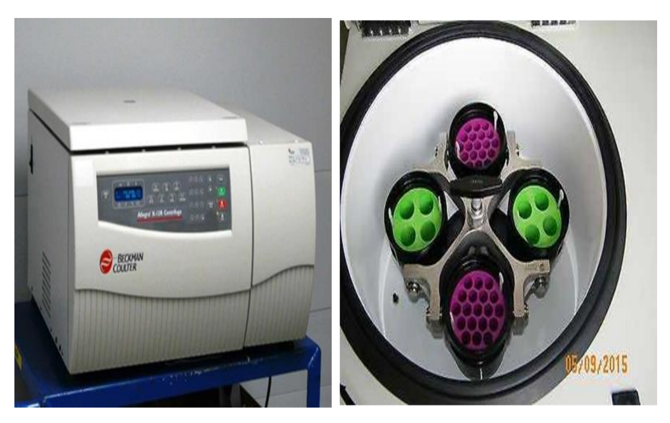
Figure 1: Bechman AllergaX12u series.