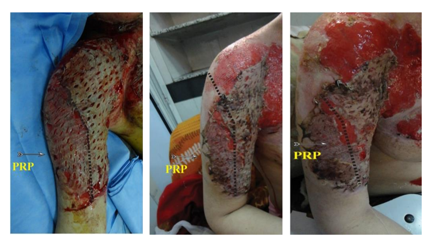
Figure 3: Photographs of PRP-treated meshed graft case at days 0,4,10 (from left to right).