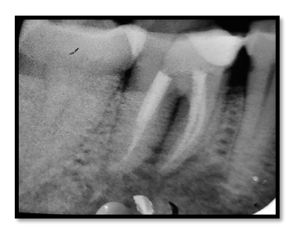
Figure 2. Pre-operative periapical photograph