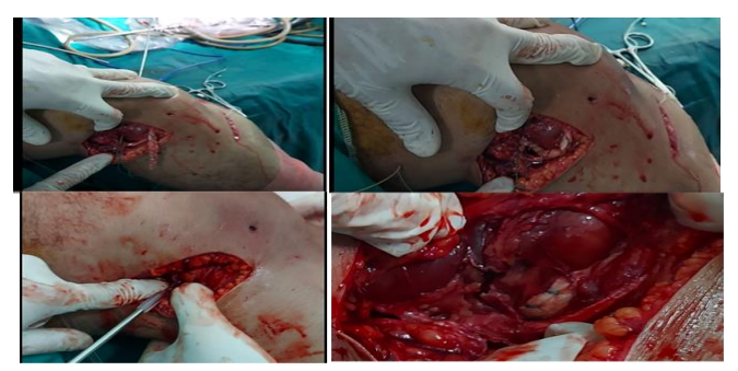
Figure 4: Passage and fixation of ITB graft to the frmoral tunnel