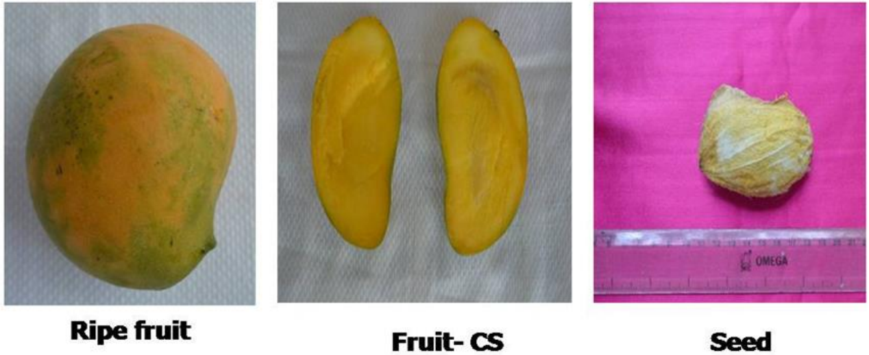
Figure 2: Fruit characters of Potalma variety